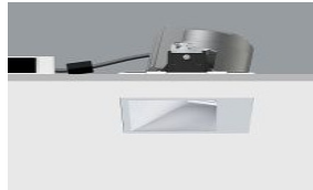
Quintessence Product review>>>