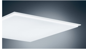
Liventy Product review>>>