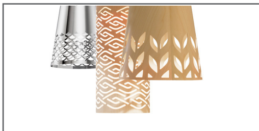
Lesima LED Pendant Product information >>>

Even from a distance, it's impossible to overlook the Trilux LESIMA's individual design and decorative accents. The luminaire shades are available in a variety of shapes, sizes and materials, and provide in-room orientation through their specific decorative elements and translucent light patterns. In addition to an appearance that sets just the right mood, LESIMA high-lights merchandise in a targeted, powerful manner.