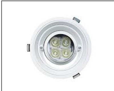
Quintessence Spotlight Product information >>>