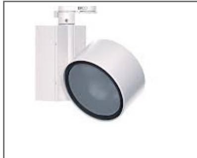
Optec Spotlight Product information >>>