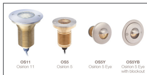
Osirion LED Product information >>>

The desirable effect of infloor uplighting is now feasible as LEDs operate at lower temperatures compatible with materials like carpet, vinyl and timber. The result - freedom of both interior and exterior lighting design.