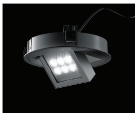
Cantax Recessed Spotlight Product information >>>

The Cantax recessed luminaire, adds more flexibility to this successful range of track spotlights. In high and low rooms, different sizes and shallow recess depths facilitate the integration into the ceiling. Thanks to the tiltable and rotatable luminaire head, the recessed spotlight can be adjusted individually. The highly efficient system consisting of collimating and interchangeable Spherolit lenses provides the designer with a wide variety of light distributions – be it for precise accent lighting using narrow spot, the washlighting of horizontal product displays with oval flood or the uniform illumination of shelves using wallwashing.