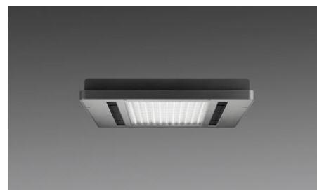
Mirona QL LED Product information >>>

The Mirona QL LED was designed as a lighting solution for especially high halls and special requirements. The luminaire ensures optimal visual conditions with pleasantly glare-free and homogeneous light as well as high light output. At the same time the high-bay luminaire is highly economic – almost 50 % of energy costs can be saved compared to standard lighting systems.