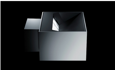
Pantrac LED Wall Luminaire Product information >>>

This ceiling washlight makes the task of creating uniform uplighting incredibly easy. Pantrac wall-mounted luminaires focus on adding lighting effects to ceilings. Their compact size make them an unobtrusive element in any space.