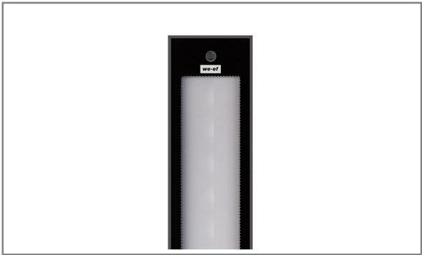
ETT130 LED Uplight Product information >>>