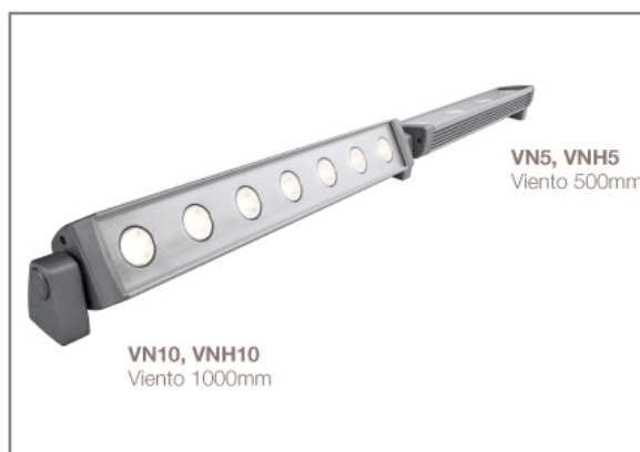
Megabay Viento Product information >>>